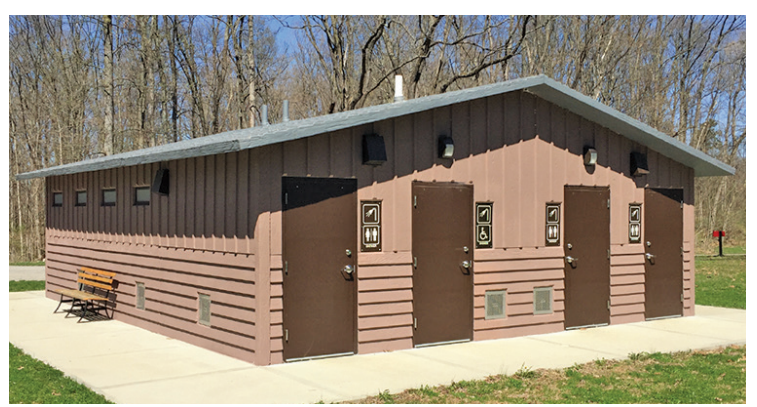
Cheyenne - 26' x 30' Two Multiuser Fully Accessible Restrooms with Four Separate Shower Rooms

CXT® manufactures precast concrete restroom, shower, concession, and multipurpose buildings for use in parks and recreational sites nationwide.