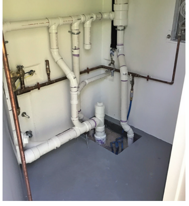
Pioneer - 10'6" x 12' Single User Fully Accessible Restroom with Shower